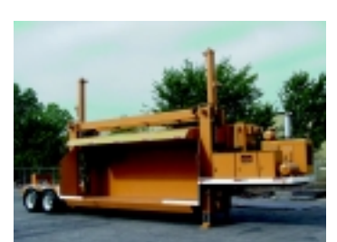
00:10 — Cylinders moving into place