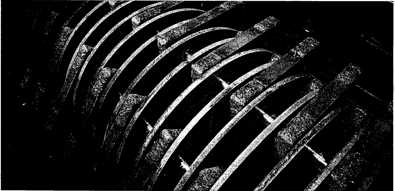
WA Series rotor assembly featuring optional tungsten carbide coated hammers for highly abrasive applications.

The WA Series is a gravity discharge hammer mill that can be constructed with a wide variety of grinding rotors and screen configurations to guarantee unmatched performance. Available in more than 20 sizes, ranging from 6" to 72", each mill features replaceable wear plates to protect the mill housing from wear that may result from processing abrasive materials. All models of the WA Series are custom configured to suit the user's material and production goals. In-feed and discharge chutes are designed to accommodate any method of feeding and takeaway, ensuring a clean and safe operating environment.