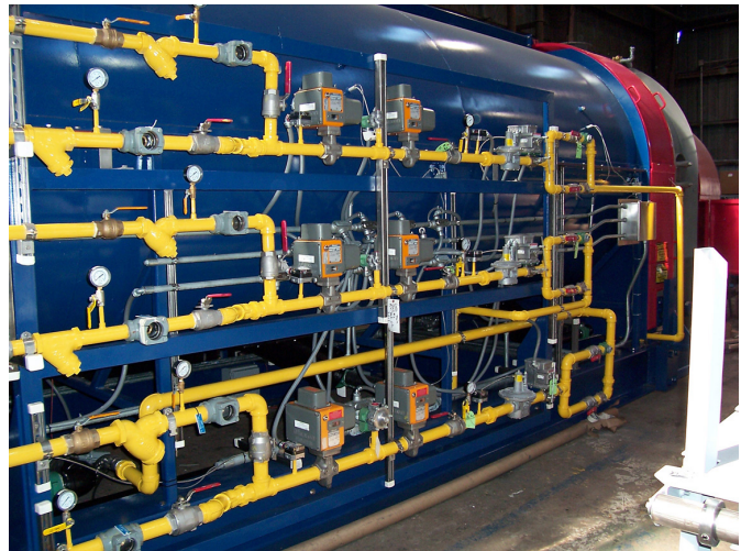
Dual valve trains on rotary drum unit.