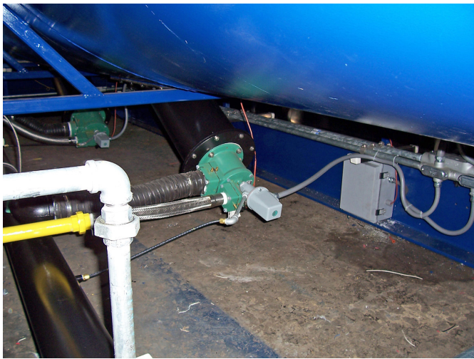
Two of four Eclipse ThermJet (TJ0300) burners firing around the rotary drum.