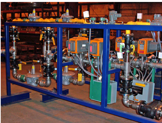
Dual valve trains for each burner can supply natural or digester gas.