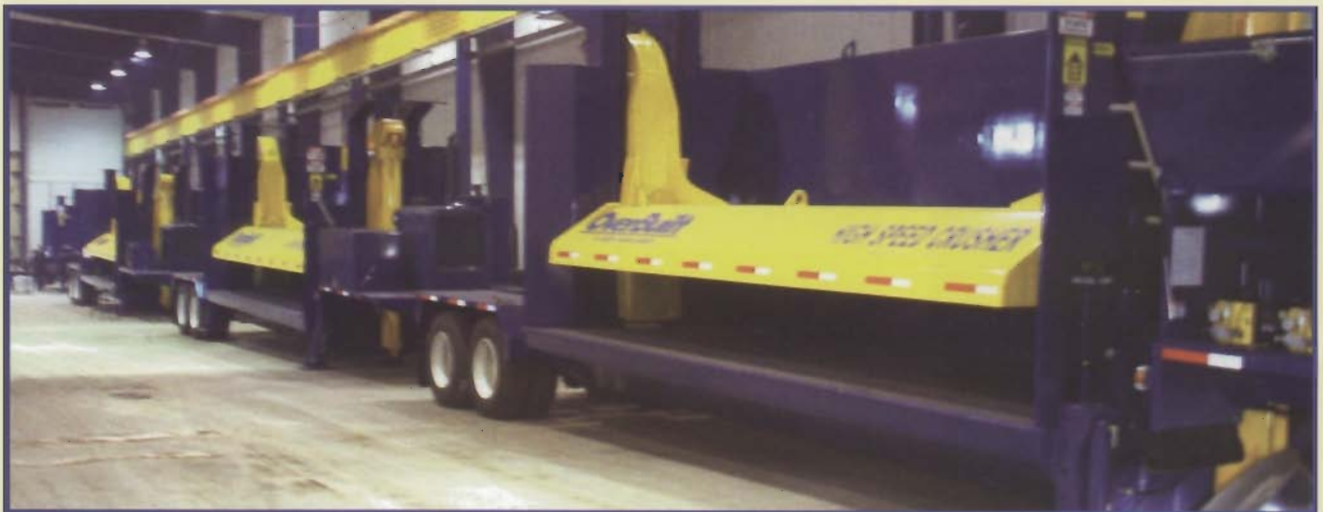
Four car crushers in final assembly at our manufacturing facility.